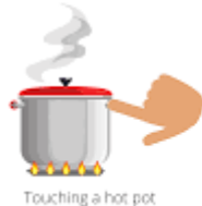
Touching a hot pot