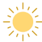
The Sun's heat rays