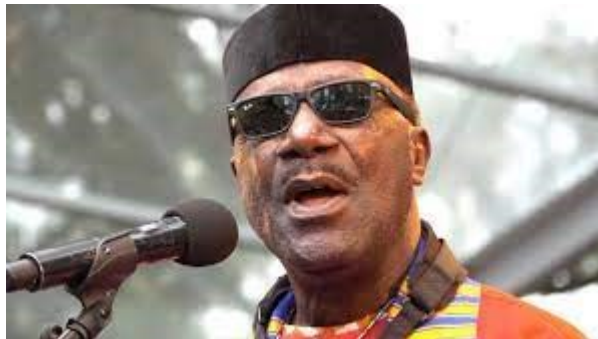
Gyedu Blay Ambolley